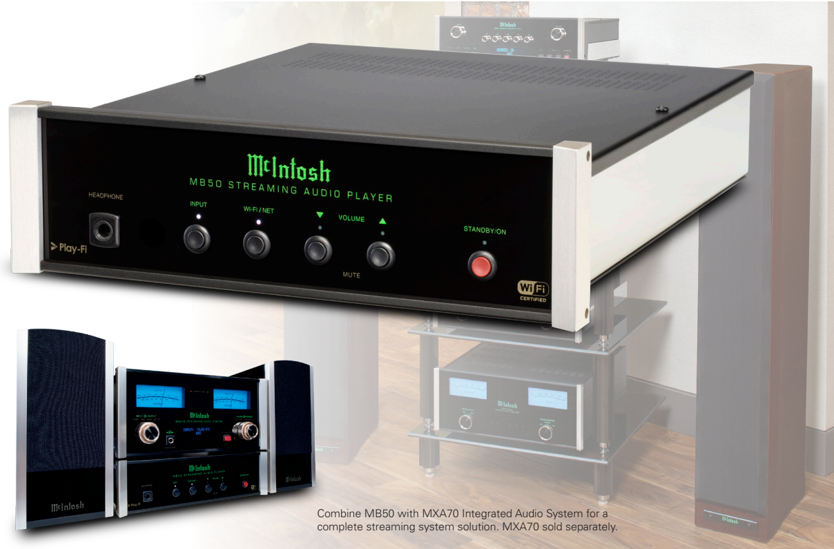
Combine MB50 with MXA70 Integrated Audio System for a complete streaming system solution. MXA70 sold separately.

1. All services may not be available in all regions; certain services may not yet be enabled for all apps; subscriptions may be required. List subject to change.